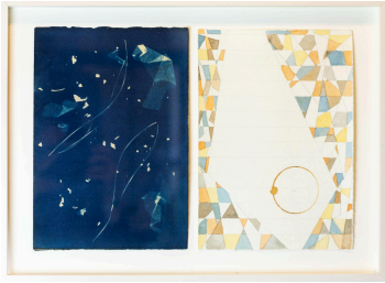
Sari Carel Before The Circle 2022 cyanotype, tea, watercolor, pencil, paper 13 ¾" x 19 ¼" x 1 ½"