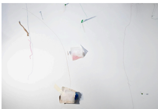
Clare Churchouse Bulb By An Open Window 2023 thread, brads, ribbon, wool, plastic tubing, pins, fabric, canvas, tape, paint, card, wood, fake grass, contact paper, styrofoam, wire, chalk, photo, ceramic, sponge, paper clip, cotton wool, paper, mesh 64" x 80" x 5"