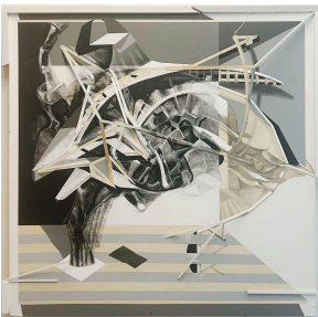
Amir Hariri Cobweb Afternoon 2020 acrylic and graphite on panel with wood assemblage 50" x 49" x 6"