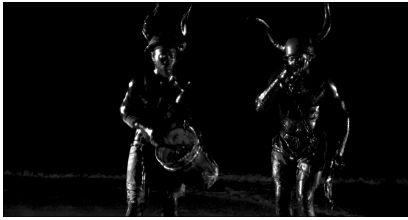
Billy Gerard Frank Second Eulogy: Mind The Gap (Jab Jab NO.2) 2019 photographic print - HD aluminum panel 55.5" x 66.25" x 2"