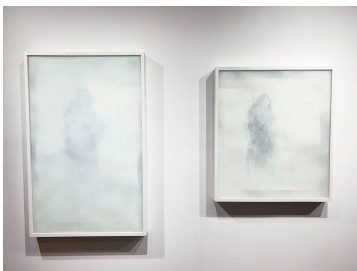
Negin Mahzoun Haft paykar 2019 print on linen, black thread, acrylic 27" x 43" x 3" in and 31" x 27" x 3"

www.studios-efanyc.org IG: @efastudios studios@efanyc.org