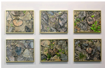
Lise Kjaer Heartstones in the Watermill 2023 digital photography 12 pieces 12" x 9"