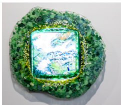
Joyce Yu-Jean Lee Shan Shui Wildfire 2024 kiln-formed glass, iPad 12.5" x 12.5" x 3"