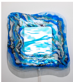
Joyce Yu-Jean Lee Extreme Niño 2024 kiln-formed glass, iPad 13" x 13.5" x 1.25"