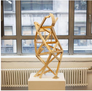
Amir Hariri Study for Shelter 2020 cement and wood 24" x 24" x 48"