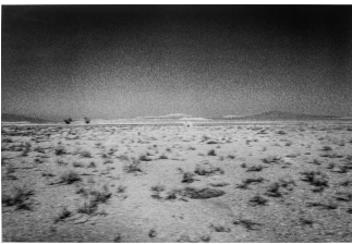
Tooraj Khamenehzadeh The Poetry of Bewilderment 2020 photography 40" x 60"