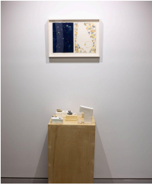
Sari Carel Kin (#5, 4, 8, 9, 10) 2022 variable materials variable dimensions