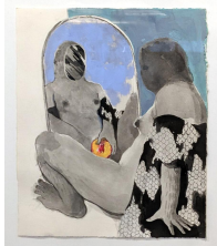
Jia Sung After the Incident of the Peach Banquet 2019 Ink and gouache on paper 11 x 13 inches