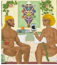
Watson Mere Eden 2022 Microsoft Paint, acrylic, oil stick on canvas 36 x 24 inches