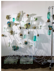
Nazli Efe Kanlica (My Grandfather's House) 2022 IV bags, IV pole, mulch, silicon tubing beeswax, oil sticks, acrylic, resin, photographs, found objects from nature, glass containers, aquarium pump, chains, metal wire 79 x 87 x 63 inches