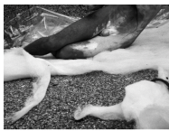
Untitled 1998/2016 Archival inkjet print 30 x 45 inches (#2/5)