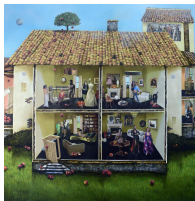
Guido Garaycochea A Doll's House 2022 Mixed media on canvas 60 x 72 inches