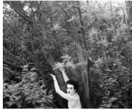
Carlos Motta Untitled 1998/2016 Archival inkjet print 30 x 45 inches (#2/5)