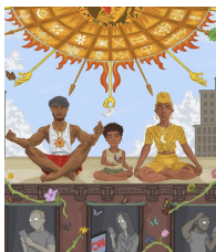
Watson Mere My Brother's Keeper 2020 Microsoft Paint, acrylic, oil on canvas 48 x 36 inches