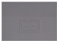
The Study of Threshold Space #2 2018 Relief and Letterpress print on velvet paper 4.5 x 6.5 inches