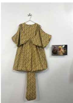
Yali Romagoza A woman's body is her nation (Feminist Hero) 2023 photo print on aluminum with garment 12" x 8" inches photo print approximately 60" x 28" inches garment Installation