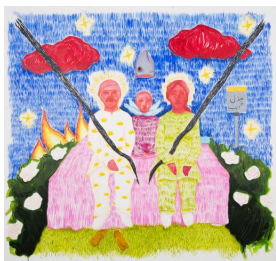
Noormah Jamal Manzil Kareeb (Destination is close) 2022 Acrylic on canvas 5' x 5'