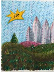
Noormah Jamal Sabr (Patience) 2022 Oil pastel on arches paper 16" x 12"