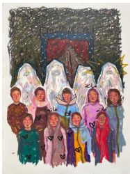
Noormah Jamal The Garden 2023 Oil pastel on arches paper 16" x 12"