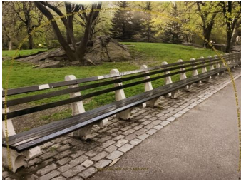
Finnegan Shannon Unicorn 2023 iPhone photo, text Dimensions variable