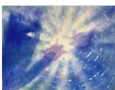
Calvin Kim Fluttering 2023 Oil on canvas 11" x 14"