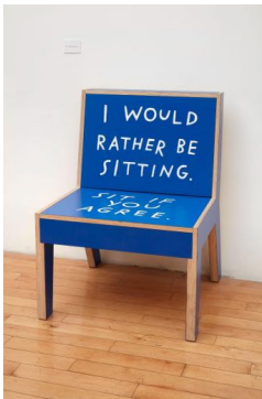
Finnegan Shannon Do you want us here or not (CUAG) 2020–ongoing Baltic birch, poplar wood, plastic laminated 35" x 27" x 27"