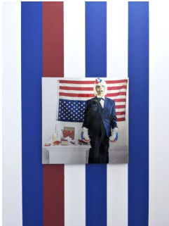
Yali Romagoza Untitled (Mami Yanqui) 2023 Approximately 160" x 30" Installation, photo print on aluminum and paint on wall