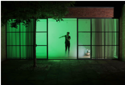
Alex Schweder Futures Alloyed Into A Past 2021 Video 5'08"