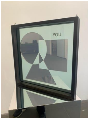
Jiwon Rhie Two Tiered Cognition_You 2023 Plexiglass, glass, wood 12.5"x125"x2"