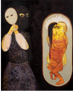
Samira Abbassy Double Blind 2020 Oil on gesso panel 30"x34"

EFA Studios Partnership Show at Monira Foundation