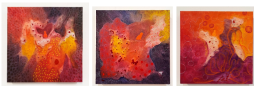
Shihori Yamamoto It Was A Beautiful Nightmare, 2022 Singing A Whale Song, 2022 Dance Like Sea Lilies, 2023