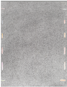
Howard Smith Charcoal Gray #4 2015 Oil on linen 30"x26"