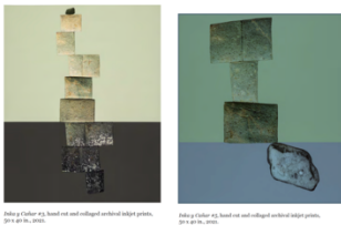
Karina Aguilera Skvirsky Inka and Cañar # 3 and 5 ( From the series, Rumi, (Quechua for Rock)) 2021 Collaged Archival Inkjet Prints 40"x50"