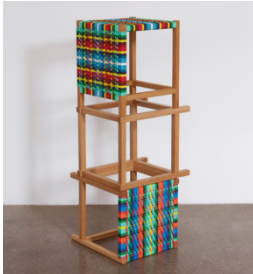
Heechan Kim Temple#01 Twill weave / PPE cord, recycled PET cord, white oak, steel nails 47"x18"x18"